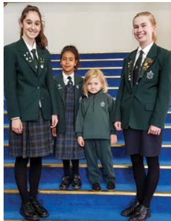
Left to right: Years 7–11, Primary, Preschool, Years 12–13