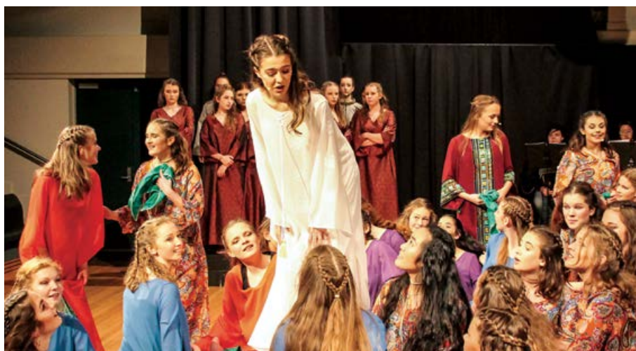
The 2017 musical Jesus Christ Superstar was a hit with the performers, crew and audience last year. We are looking forward to the Year 7–13 production of 'Alice' in 2018.

Marsden offers a wide range of cultural activities and there are many opportunities for your daughter to get involved.