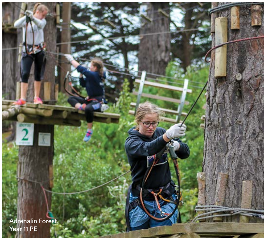
Adrenalin Forest, Year 11 PE