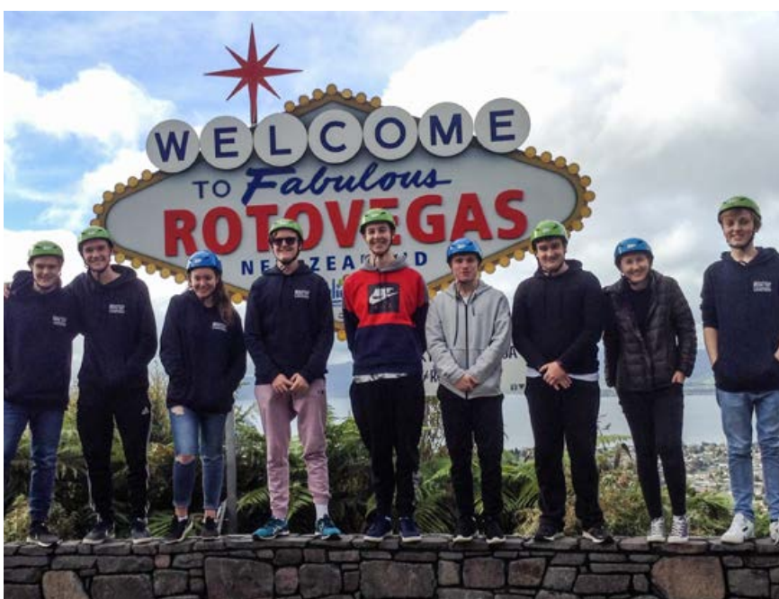
The annual Year 13 Geography Field Trip to Rotorua.