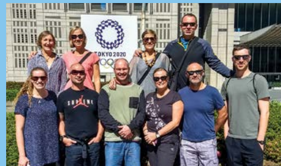
Asia New Zealand Foundation Sports Forum teachers in front of the Government buildings in Tokyo.

Another highlight was the opportunity to attend the Grand Sumo Tournament. I left with a greater appreciation of the physical nature of sumo and ideas of how we could